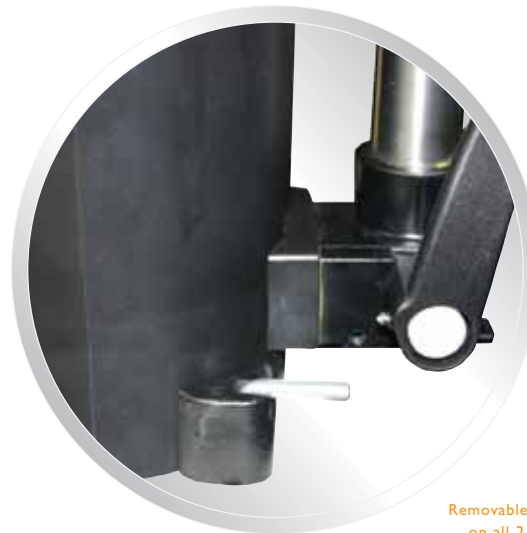
QUICK RELEASE Removable canister option available on all 2.5 Quart canister models.