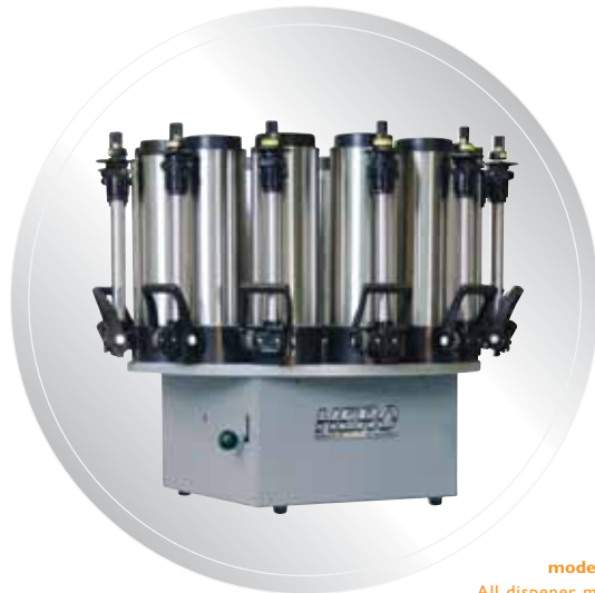
COUNTERTOP model shown D24SRM12C All dispenser models are available in countertop configuration